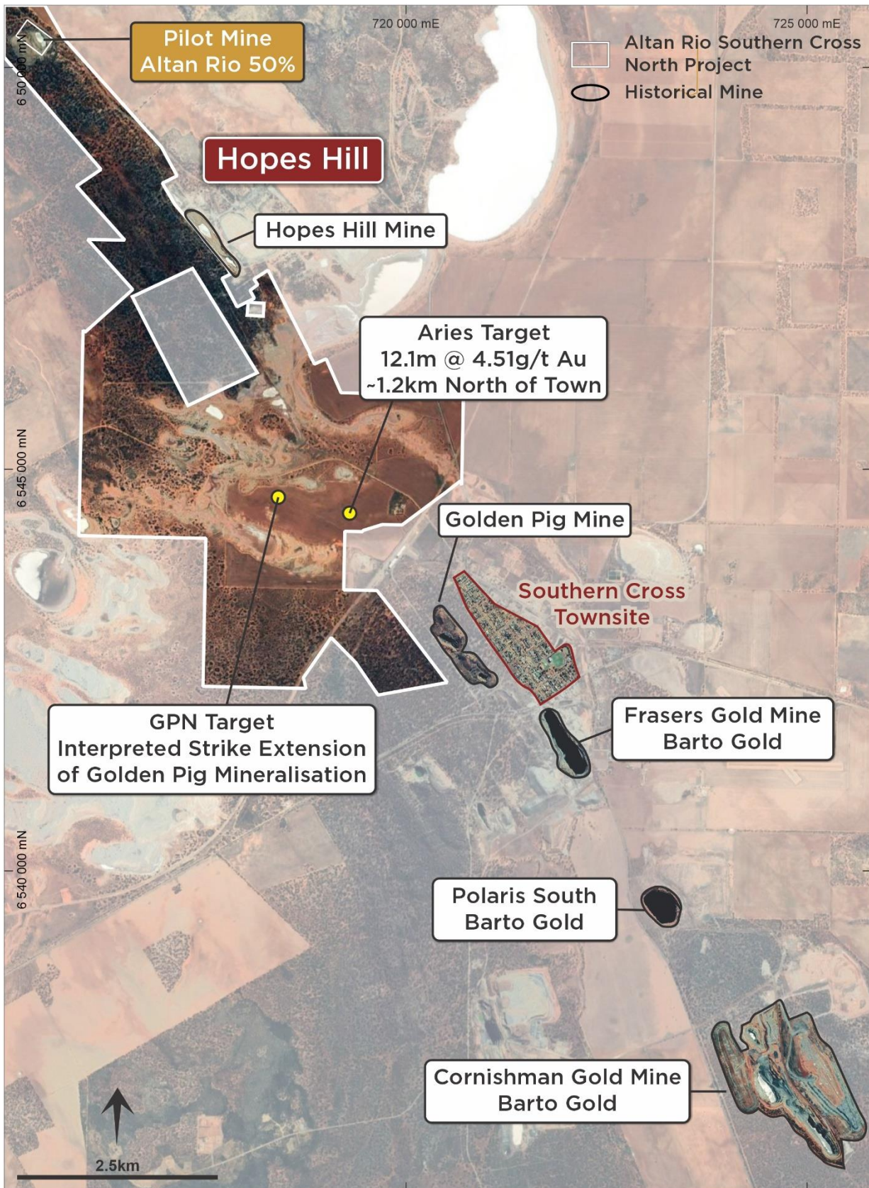
Figure 2: Location of Aries Prospect in relation to Golden Pig Mine and Frasers Gold Mine.