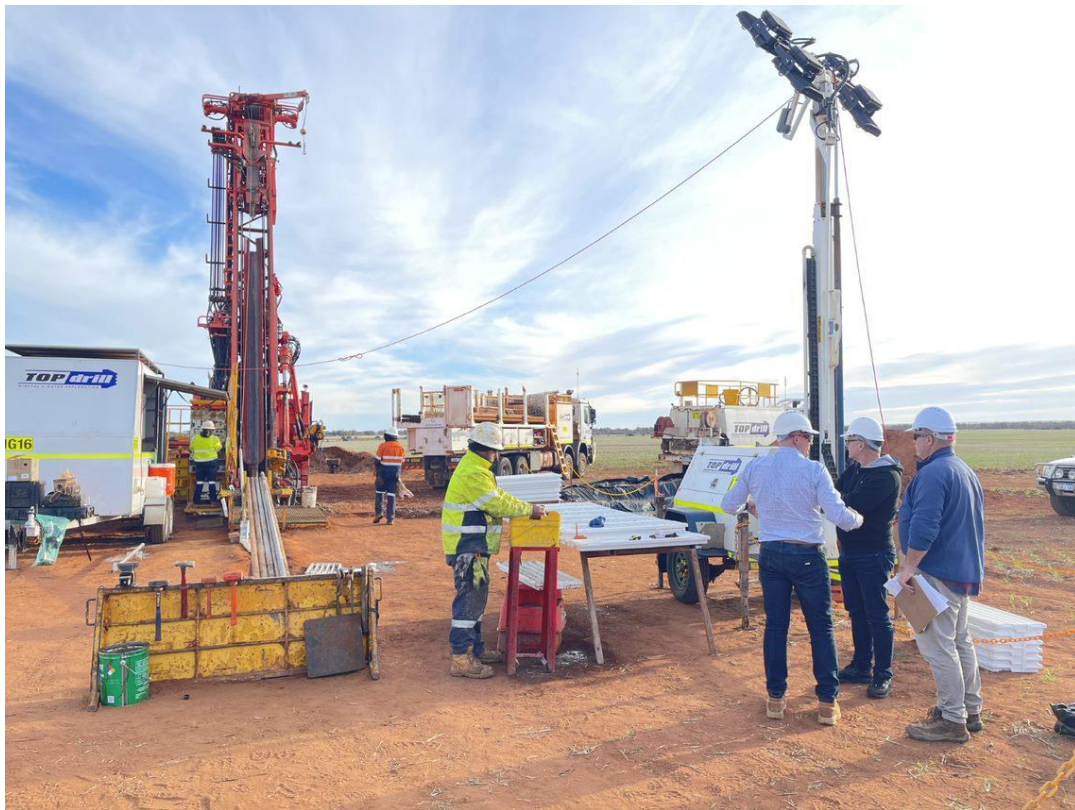
Figure 1: Diamond Drilling at the Aries Prospect

The EIS is an initiative developed by the Western Australian Government to encourage exploration in the State of Western Australia through a competitive Co-funded Exploration Drilling Program that offers up to a 50 per cent refund of direct drilling costs for innovative exploration drilling projects. (refer www.dmirs.wa.gov.au/exploration-incentive-scheme )